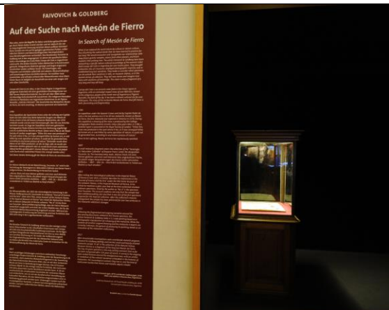
Installation view