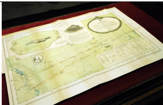
Installation view / Map