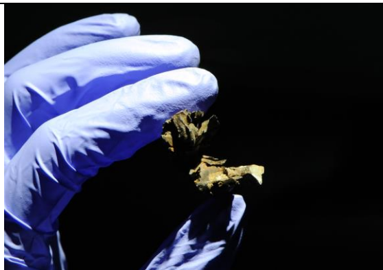
Installation view / Mesón de Fierro