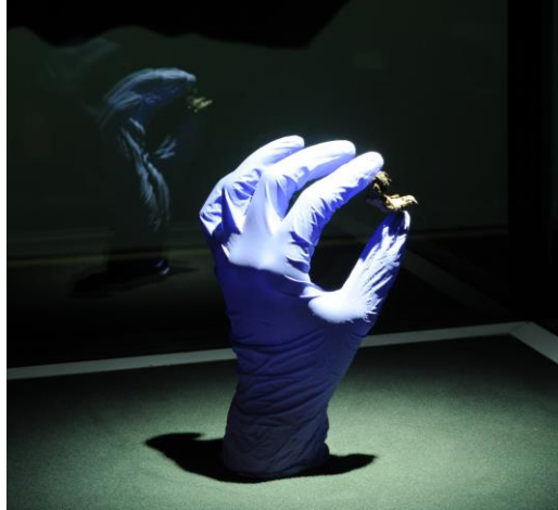
Installation view / Mesón de Fierro